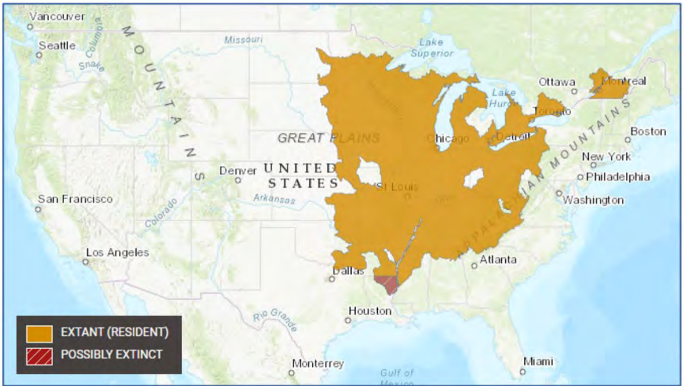
Figure 1. Mucket distribution (IUCN Redlist 2024)