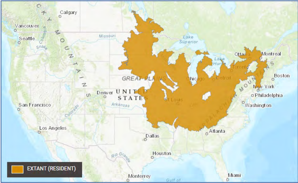
Figure 1. Pink heelsplitter distribution (IUCN Redlist 2024)

had never before been surveyed for mussels, not because mussel distribution has dramatically increased. In North America, approximately 2/3 to 3/4 of native mussel species are extinct, listed as endangered or threatened, or are in need of conservation status (Williams et al. 1993; Stein et al. 2000). Based on New York’s Natural Heritage S-rank, sparse historical data, and the plight of North America’s freshwater mussels, it is assumed that trends are declining due to a myriad of environmental stressors.