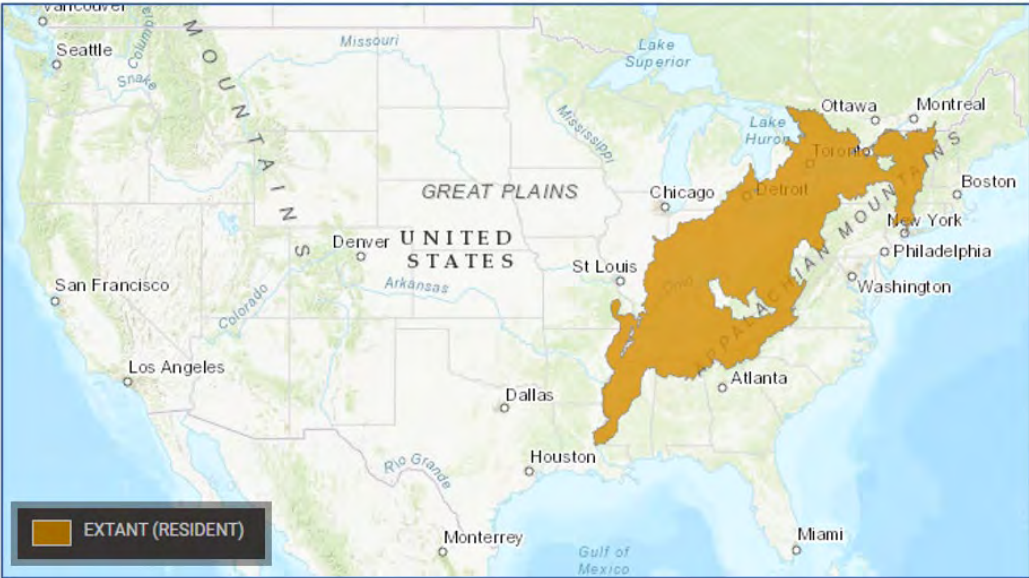
Figure 1. Pocketbook distribution (IUCN Redlist 2024)

example, mussels were documented for the first time in 50 of the 106 streams surveyed to date by the Southern Lake Ontario mussel inventory project (Mahar & Landry 2013). This is because many of these streams had never before been surveyed for mussels, not because mussel distribution has dramatically increased. In North America, approximately 2/3 to 3/4 of native mussel species are extinct, listed as endangered or threatened, or are in need of conservation status (Williams et al. 1993; Stein et al.2000). Based on New York’s Natural Heritage S-rank, sparse historical data, and the plight of North America’s freshwater mussels, it is assumed that trends are declining due to a myriad of environmental stressors.