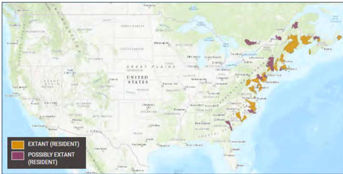
Figure 1. Tidewater mucket distribution (IUCN Redlist 2024)