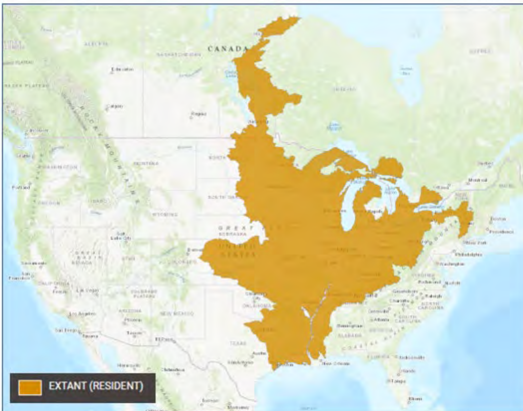
Figure 1. Wabash pigtoe distribution (IUCN Redlist 2024)