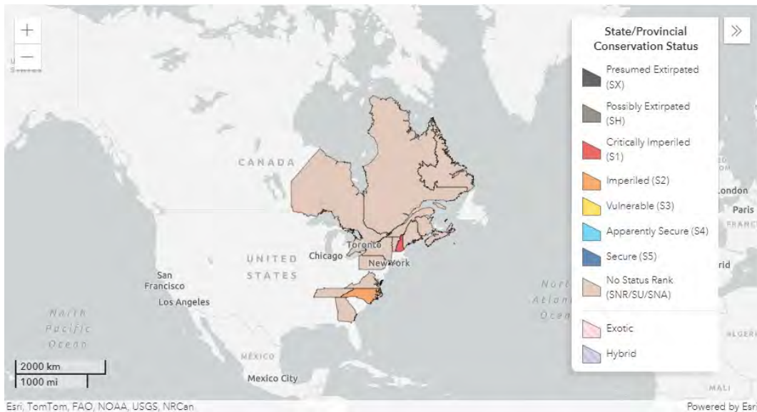
Figure 1. Conservation status of Ameletus tertius in North America (NatureServe 2023)

Trends Discussion (insert map of North American/regional distribution and status):