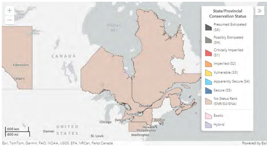
Figure 1. Conservation status of Baetis rusticans in North America (NatureServe 2023)