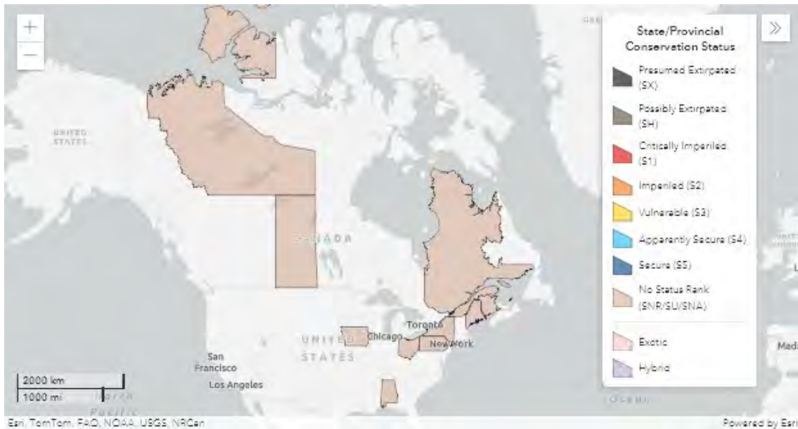
Figure 1. Conservation status of Nixe rusticalis in North America (NatureServe 2023)

There is no trend information available for this species.