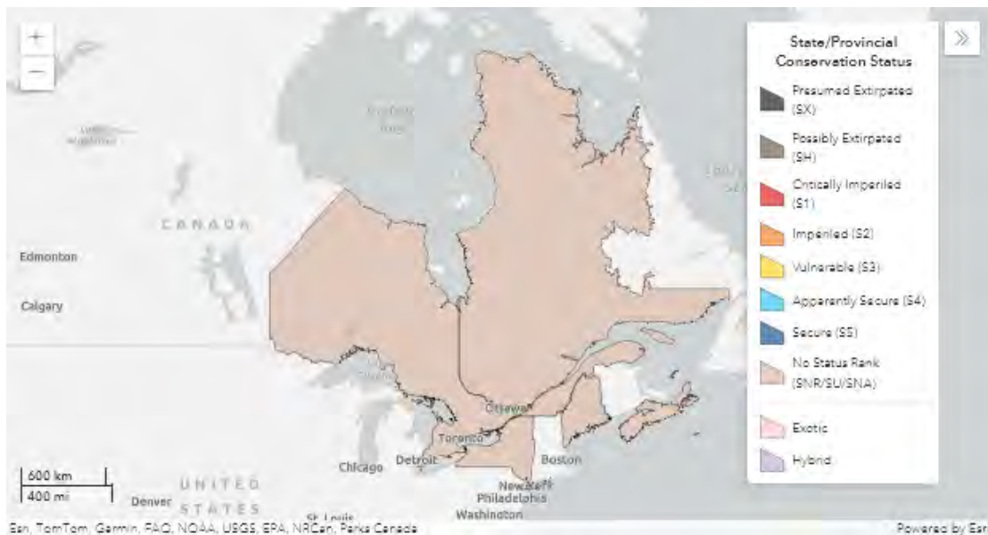
Figure 1. Conservation status of Procloeon oxburni in North America (NatureServe 2023)

Trend information for this species is unknown.