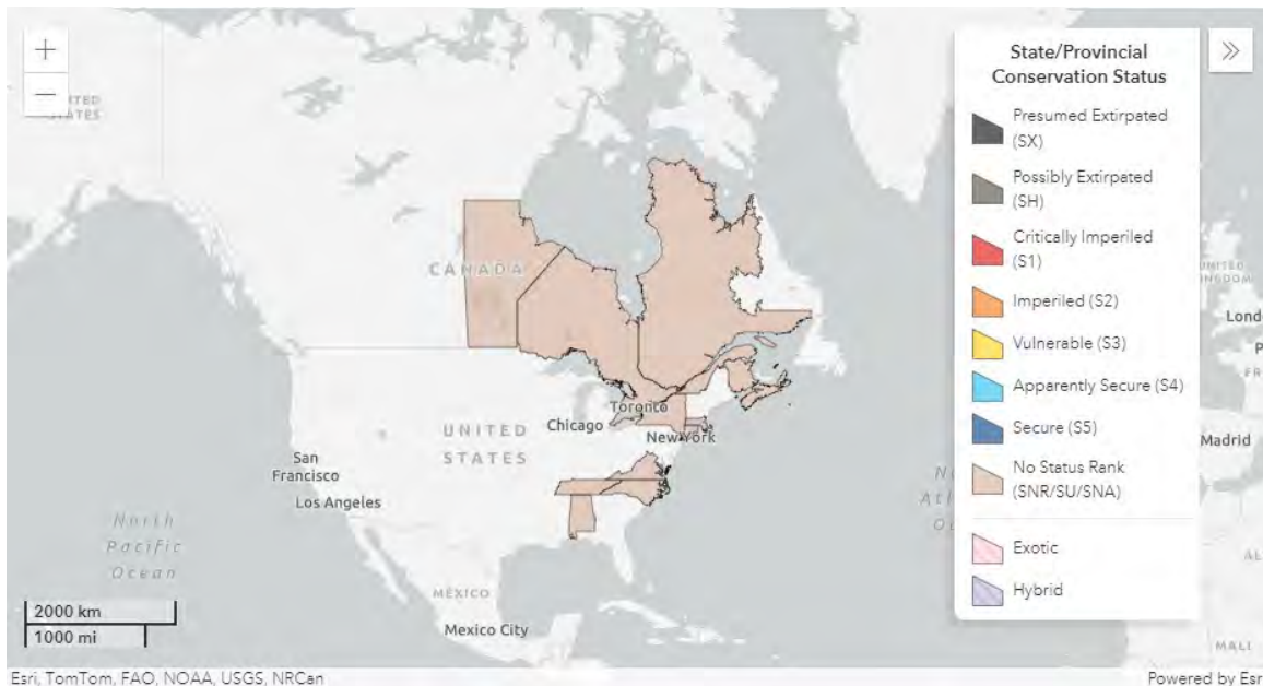
Figure 1. Conservation status of Rhithrogena anomala in North America (NatureServe 2023)

Trend information for this species is unknown.