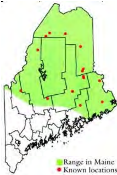
Figure 1. Distribution of Siphonisca aerodromia in the state of Maine (www.maine.gov)