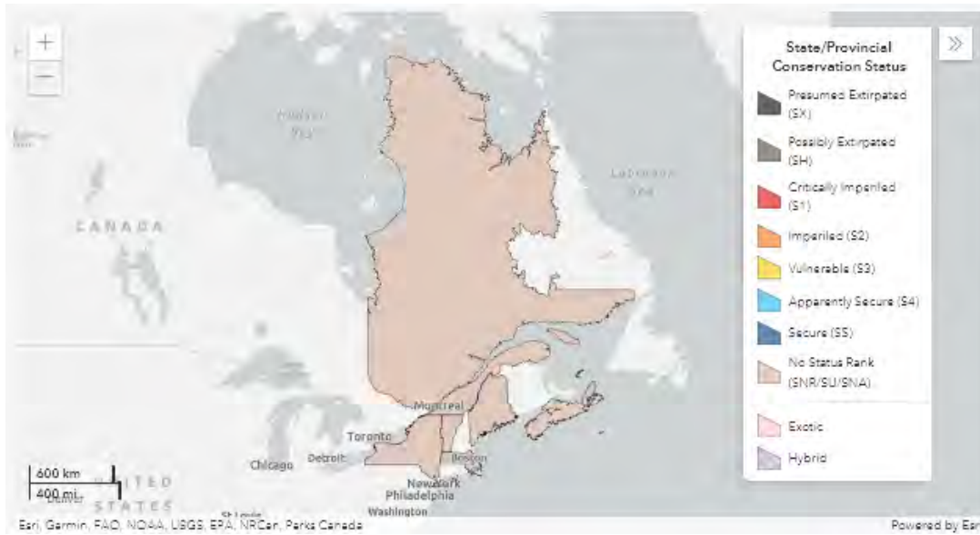
Figure 1. Conservation status of Alloperla voinae in North America (NatureServe 2023)