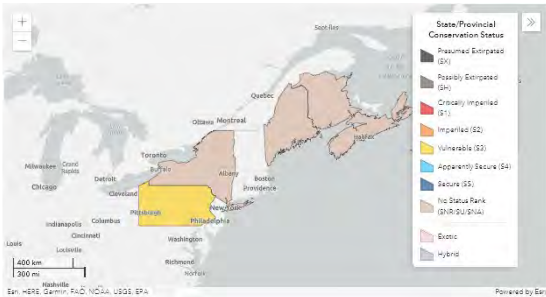
Figure 1. Conservation status of Alloperla vostoki in North America (NatureServe 2023)