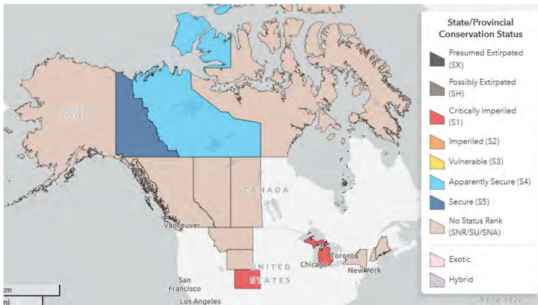
Figure 1. Conservation status of Arcynopteryx dichora in North America (NatureServe 2024).